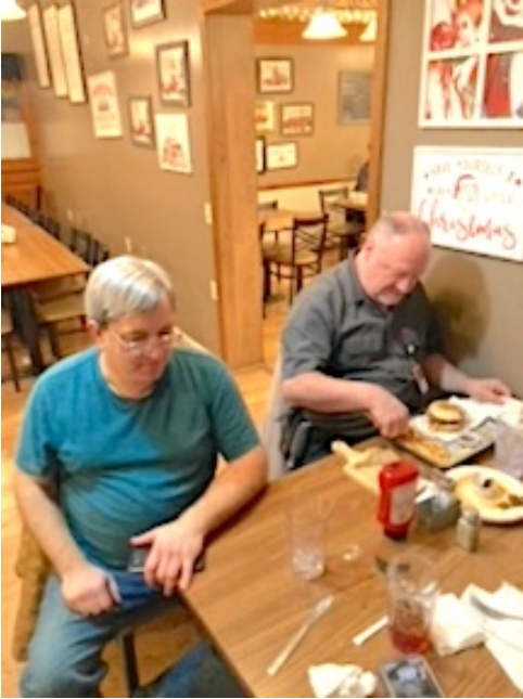
WE8TOM and WD8LEI

all captions L to R