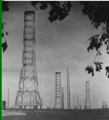
rhombic antenna supports for short wave at VOA

Along the way, WLW had several firsts, including the first remote transmitter. The 50 kW transmitters are huge. The video also covers how Crosley made inexpensive radios including crystal radios and inexpensive tube sets.