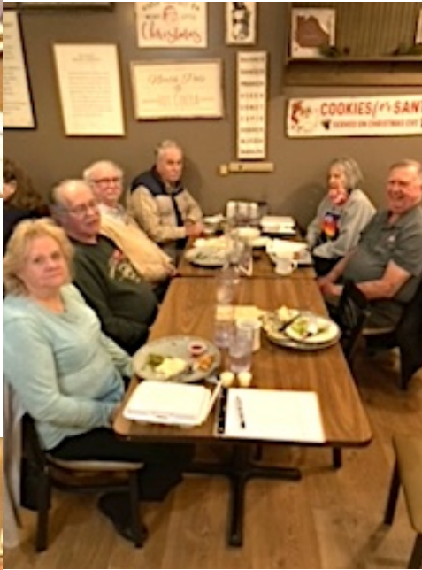
XYL Bev & KD8NJW, N8MSU, KC8IFW, N1LB, N1RB