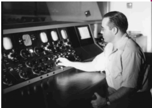
control panel at WLW

It is hard to imagine that the output would rise by a factor of 10 over the years. The transmitter